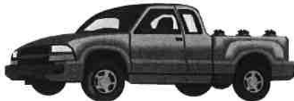
Up to 1 pick-up truck with up to an 8 foot bed filled to the top of its bed (8'x5'x2')