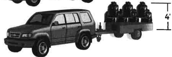
Up to 1 8-foot trailer, filled no higher than 4 feet from the trailer floor (8'x5'x4')