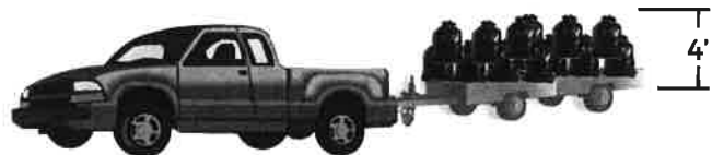
Up to 1 12-foot trailer, filled no higher than 4 feet from the trailer floor (12'x5'x4')