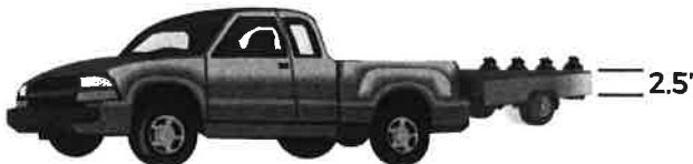
1 one-axle trailer, filled no higher than 2.5 feet from the trailer floor (8'x5'x2')